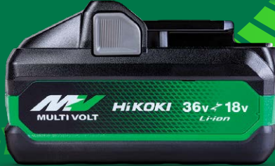
BSL36B18X HIGH OUTPUT BATTERY