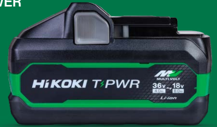
NEW BSL3640MVT HIGH OUTPUT TABLESS BATTERY