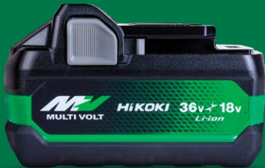
BSL36A18X HIGH OUTPUT BATTERY