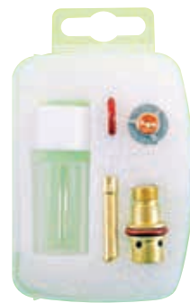
Pyrex Gas Lens Kit Medium Nozzle

★ GAS SAVINGS ★ EFFICIENCY ★ EXTENDED REACH