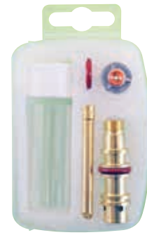
Pyrex Gas Lens Kit Long Nozzle