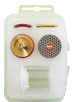
Fat Boy Pyrex Gas Lens Kit Great for Titanium!